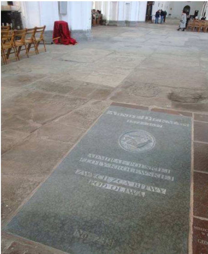
Gothic Passionist Order in Przasnysz